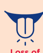
Loss of taste